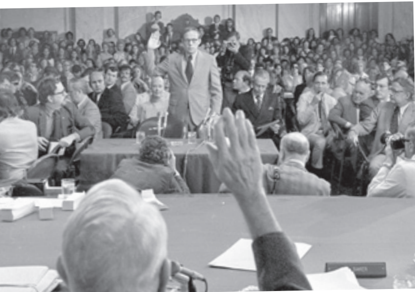
Former White House aide John Dean III, June 25, 1973