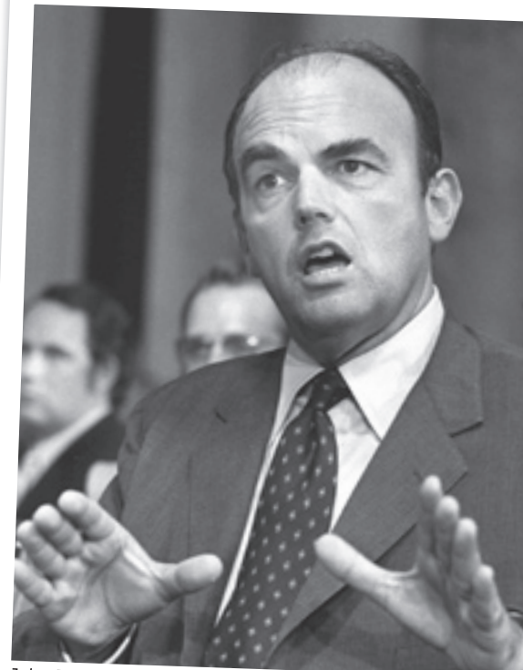
John D. Ehrlichman

"The thing that was so extraordinary about Woodward and Bernstein," Bradlee said, "is that they found out what was going on and that they did it quickly and they did it right."