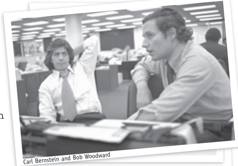
Carl Bernstein and Bob Woodward

How two journalists brought down a president and lived to tell about it.