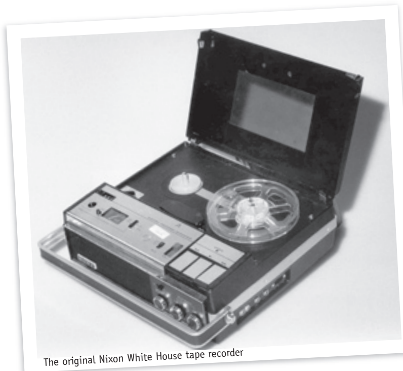
The original Nixon White House tape recorder