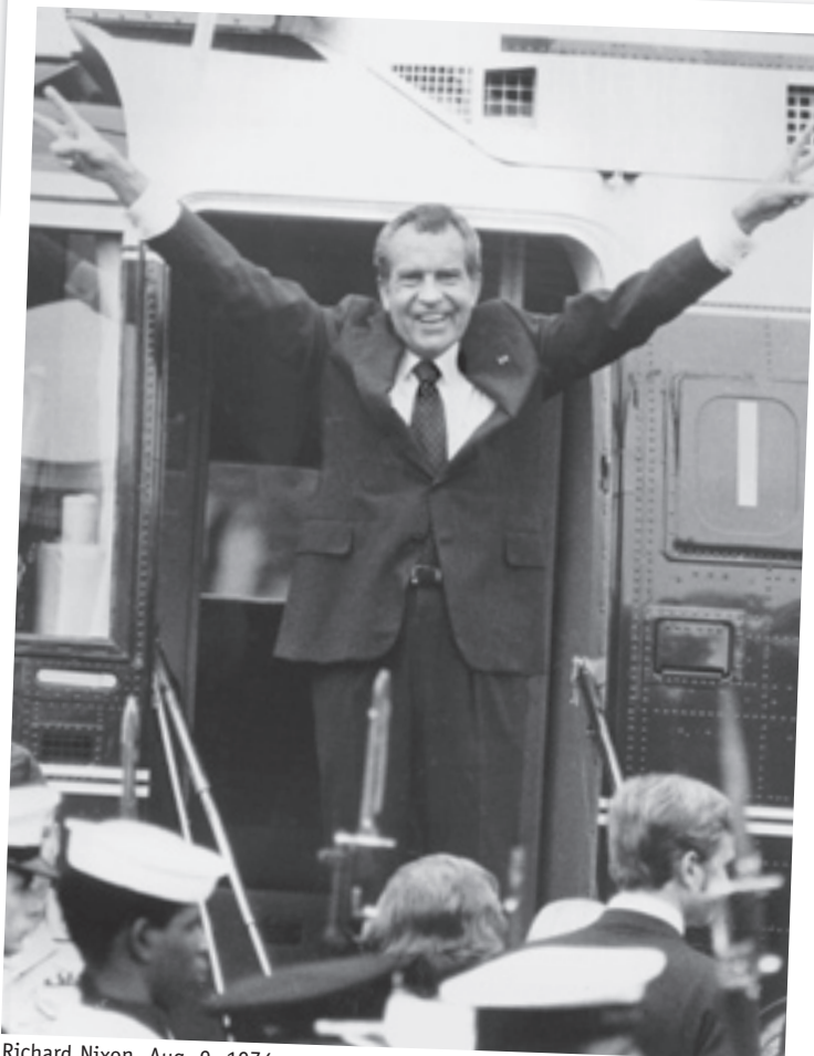
Richard Nixon, Aug. 9, 1974

After only one month in office, Ford delivers a nationally televised address in which he gives Nixon an unconditional presidential pardon for all federal crimes that he "committed or may have committed or taken part in" while in office. Nixon accepts the pardon, an action that Ford later calls tantamount to an admission of guilt.